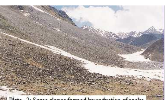
Plate- 2: Scree slopes formed by reduction of rocks