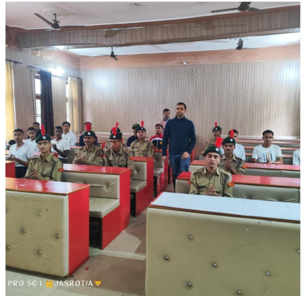
NCC Cadets of 4 J & K BN of GDC Kathua Celebrated NCC Day 2023 on 25/11/2023. A series of activities were organized on the occasion like Patriotic Song, Flute Plying, Poetry Recitation and Documentary on Indian Army: A Life Less Ordinary.