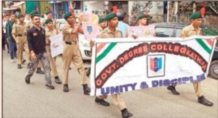
मिशन इंद्रधनुष 5.0 के दूसरे दौर के अभियान के तहत आयोजित जागरूकता रैली में भाग लेते एनसीसी कैडेट्स। (अर्जुन शर्मा)

र: के 5 दूसरे नुष जा रही दिया योजित 16 मीर किया 0 से 5 टीका पर