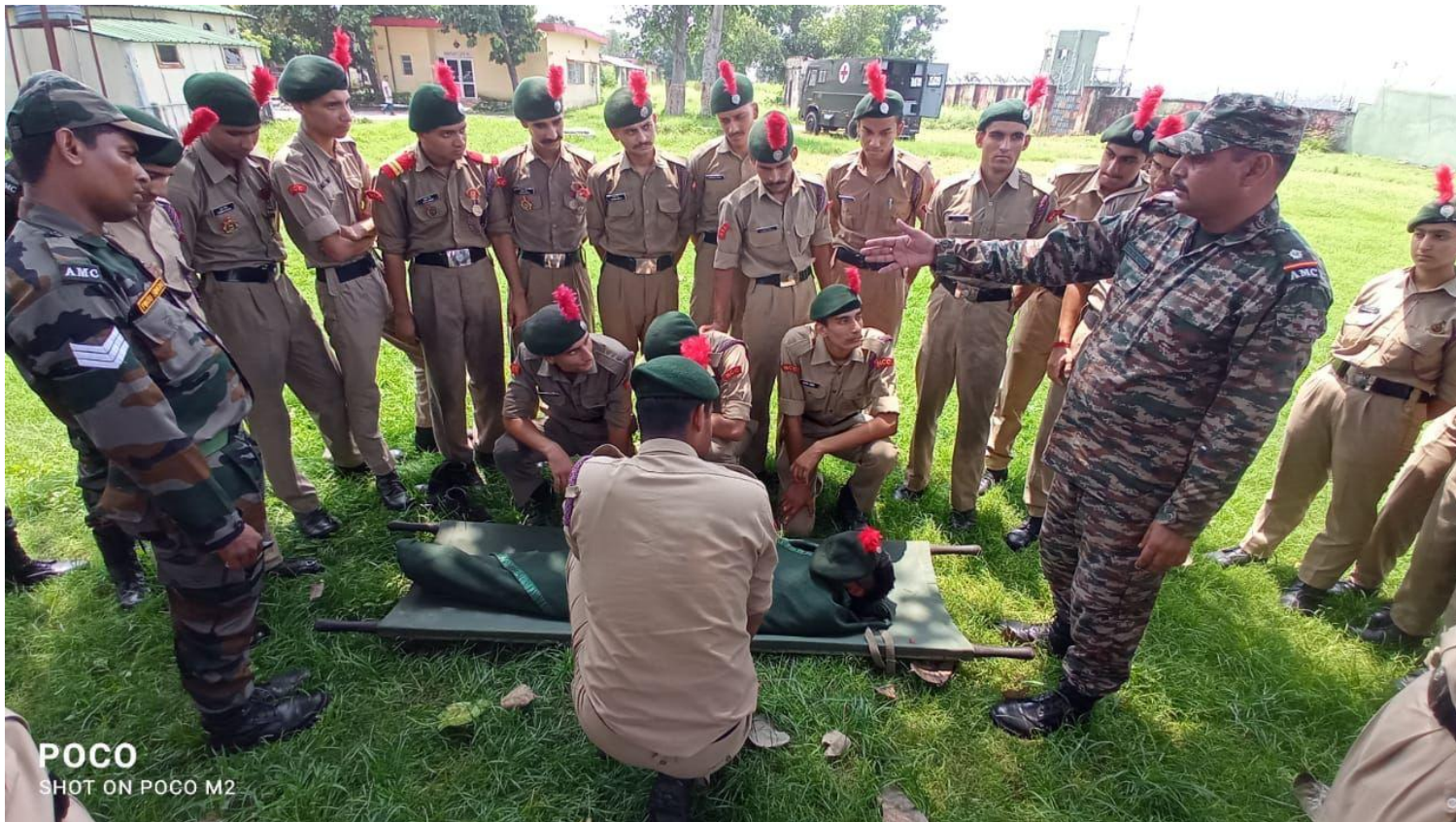
Cadets of 4 J&K BN of GDC Kathua participated in 10 day camp on Disaster Management which is organized by MH Jammu from 18 Sep to 28 Sep 2023.