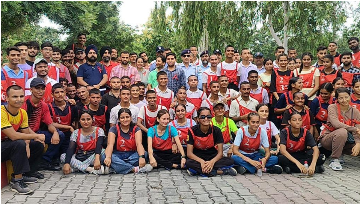
On 10 th August 2023: A plantation drive was conducted at NSS adopted village Bhagthali under “meri mart mera desh” campaign.