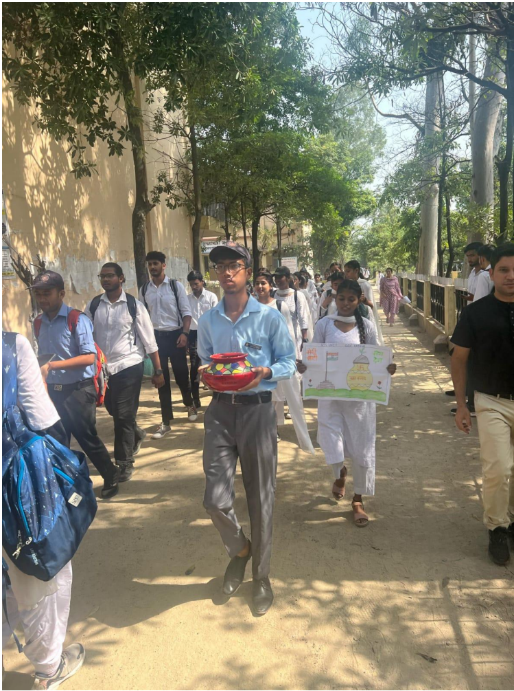
On 1 st November to 7 th November 2023: Vigilance Awareness Week was celebrated at GDC Kathua