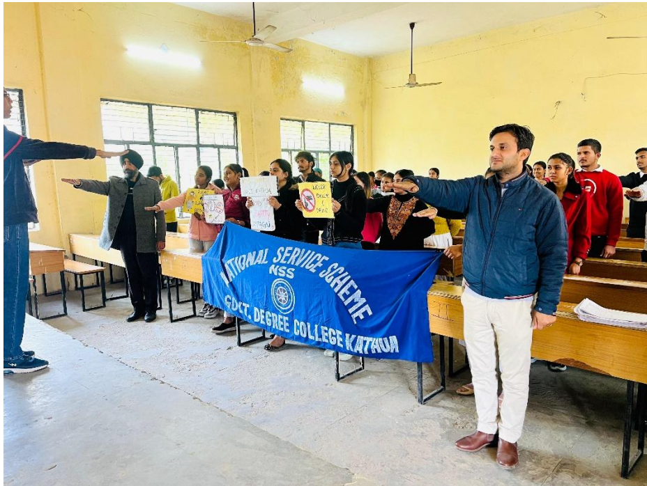
On 12 th January 2024: National Youth Day was celebrated