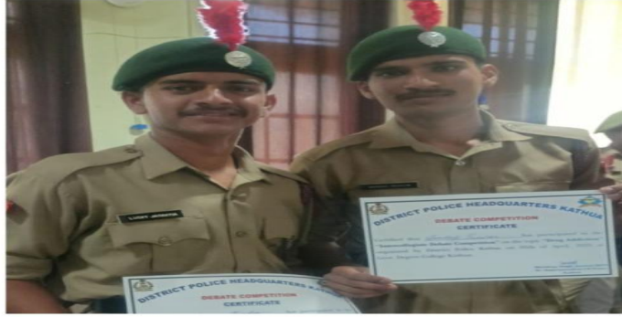
NCC Cadets of 4 J&K BN of GDC Kathua participated in Intercollegiate Debate Competition on the topic Drug Addiction on 9/04/2023.