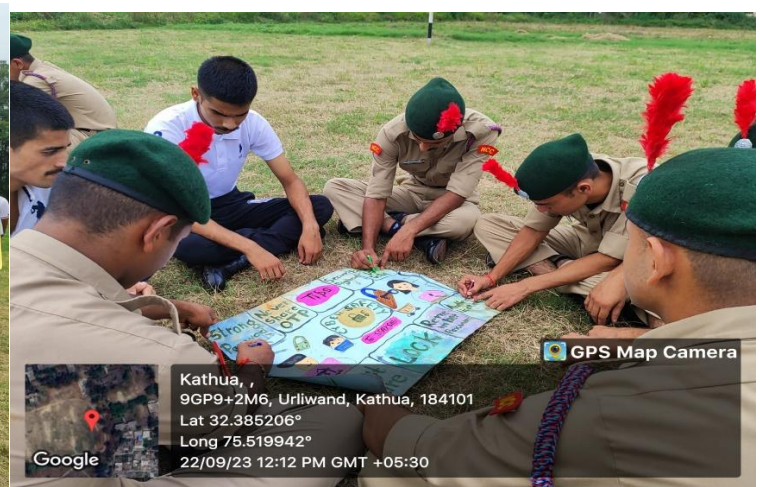
NCC Cadets of GDC Kathua Observed Cyber Security Week from 18th September 2023 to 23 September 2023 on 22/09/2023.