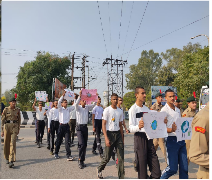
NCC Cadets of 4 J&K BN of GDC Kathua conducted awareness rally on Clean India Green India, use of Dustbins and Cleaning of Water Bodies.