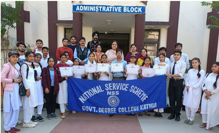
On 26 th November 2023: Constitution Day was celebrated in GDC Kathua