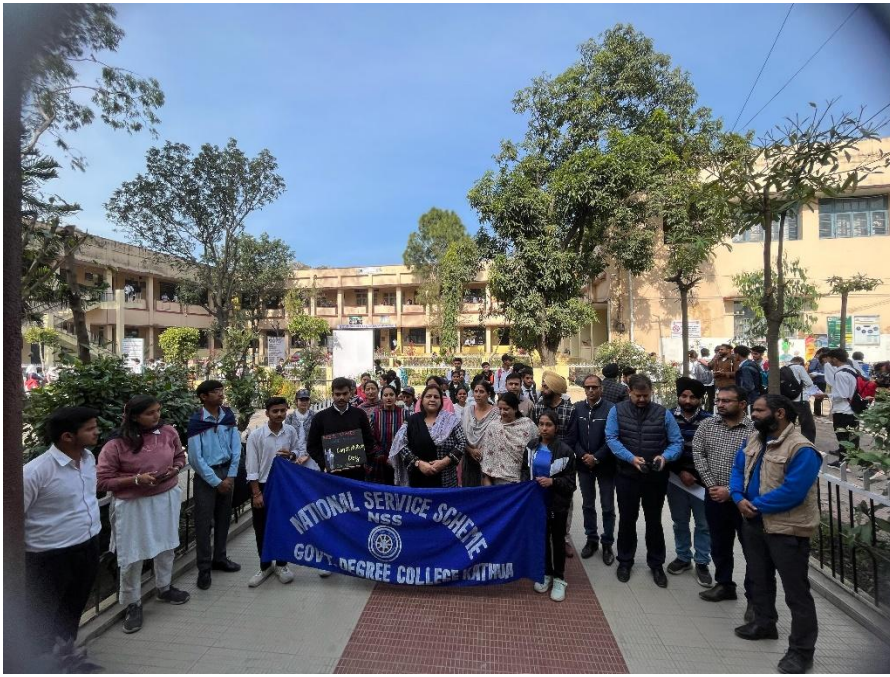
19 th December 2023: Signature campaign was organized under Viksit Bharat Campaign