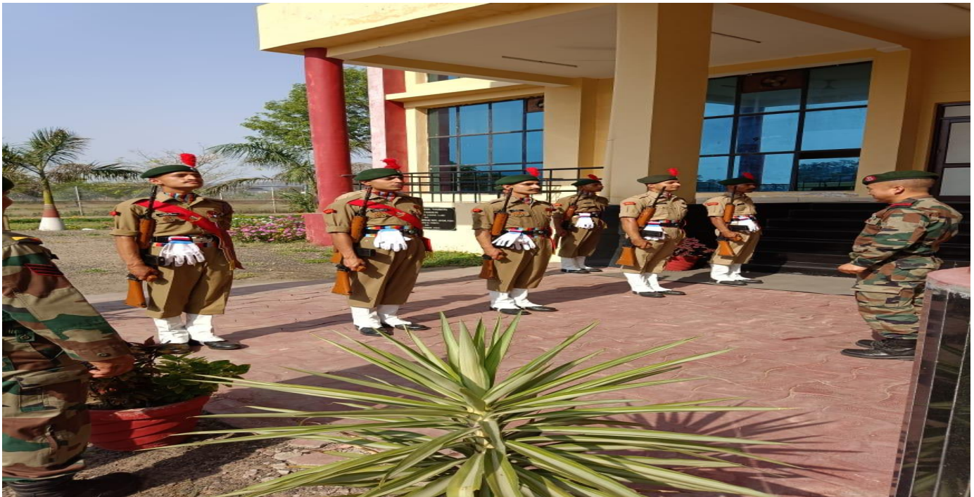
Cadets of 4 J&K BN NCC of GDC Kathua presented guard of honor to GOC on his retirement in Sainik School, Nagrota on 17/04/2023.