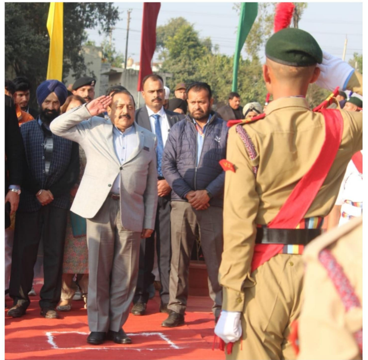
NCC Cadets of 4 J&K Bn of GDC Kathua present Guard of Honour to Dr. Jatinder Singh Union Minister of State (IC) for Science and Technology, Earth Science, and PMO on the occasion of Ram Pal Trust Symposium on the topics “Women at Workplace: Issues and Challenges” held at GDC Kathua on 23/12/23.