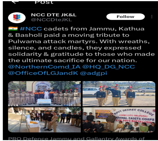
NCC cadets of GDC Kathua paid tribute to Pulwama Martyrs on 14/02/2024.