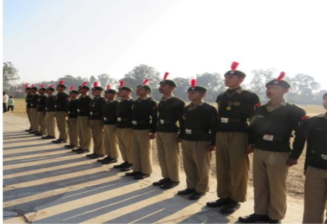
NCC “B” and “C” certificate examinations held at GDC Kathua on 18/02/2024 & 03/03/2024 respectively.