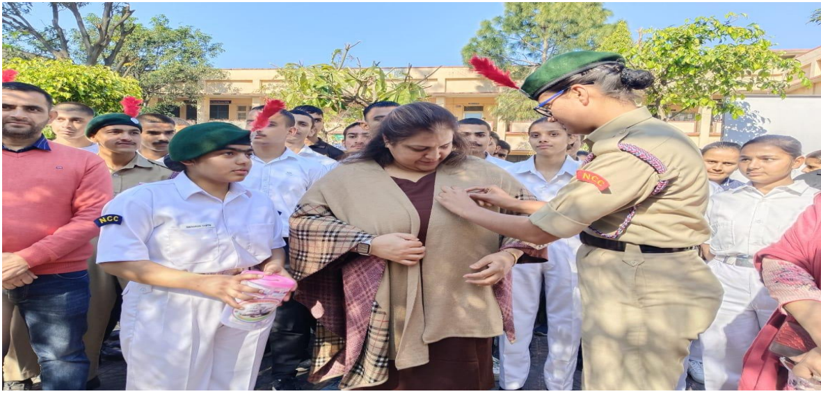
NCC Cadets of GDC Kathua celebrated Armed Forces Flag day by collecting funds/donation from the staff and General Public of Kathua town on 07/12/2023.