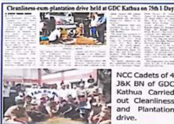
Cleanliness-cum-plantation drive held at GDC Kathua on 7th 1 Day