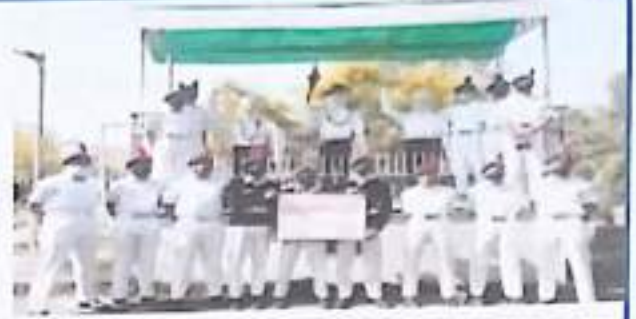
Cadets of 1 JK&L Nava I NCCUnit of GDC Kathua carried out a statue cleaning drive in Shaheed Bhagat Singh Park