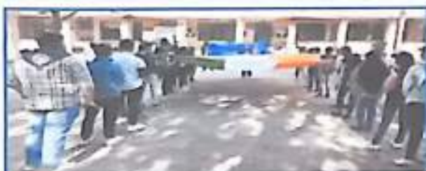
Birth anniversary of Sardar Patel was celebrated with patriotic fervour on 31st Oct. 2021. NSS Volunteers took Pledge of Unity and organized a rally on to spread the vision of Sardar Patel among people.