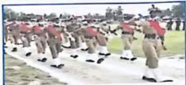
NCC Cadets of 4 J&K BN of GDC Kathua participated in Independence Day Parade on 15th August 2021 at Sports Stadium Kathua.