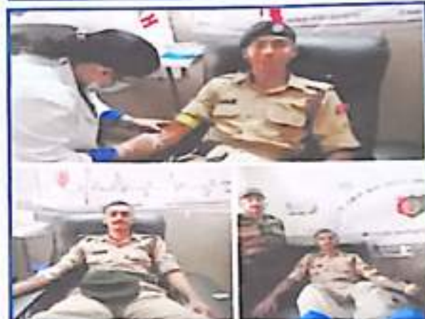
NCC Cadets of 4 J&K BN of GDC Kathua donated blood during Blood Donation Camp organized by 2 J&K Bn NCC Boys Jammu at GMC Jammu on 1st September 2021.