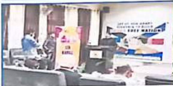
NCC Cadets of 4 J&K Bn of GDC Kathua participated in Awareness Programme on Drug Abuse under Drug Demand Reduction Campaign organized by District Social Welfare Office Kathua in collaboration with 91.1 Top FM Kathua on 8th Feb. 2022.