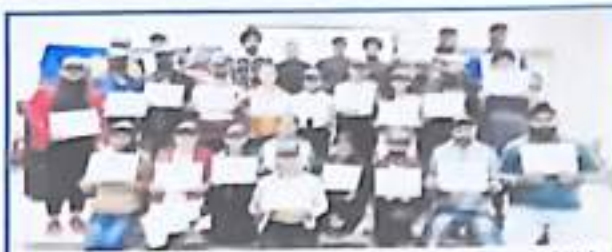
Organized a Symposium on Birth anniversary of Shri Guru Nanak Dev Ji on 18th Nov. 2021