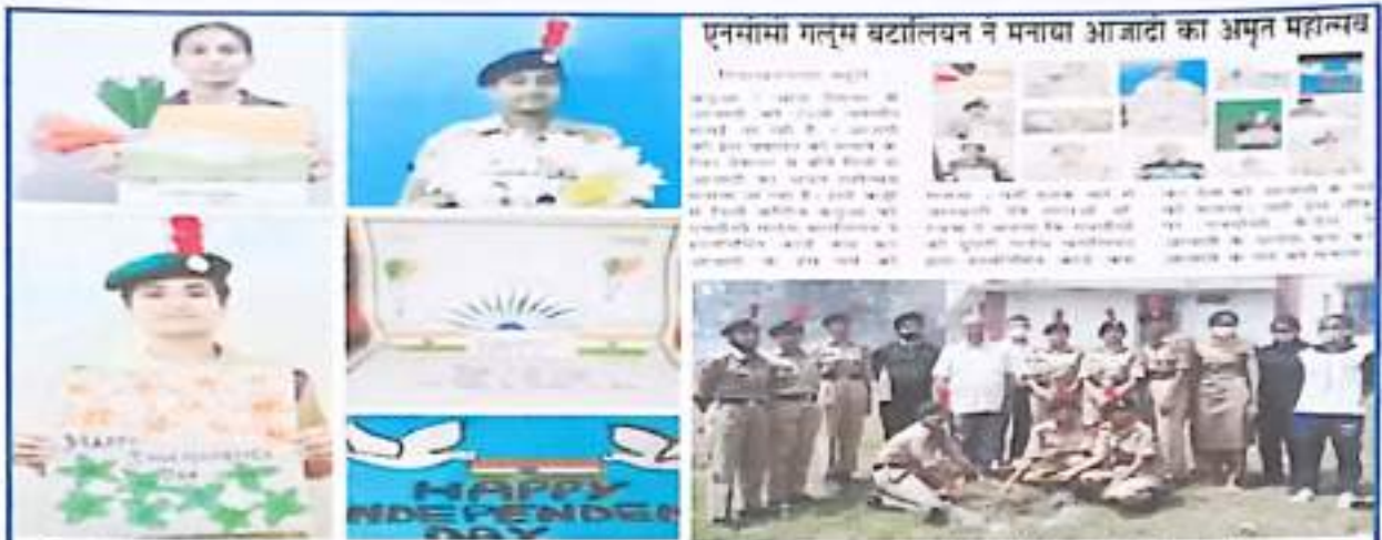
On 14 August 2021, 30 NCC cadets of 2 JK Girls Bn, participated in Card making and Plantation Drive Under Azadi ka Amrit Mahotsav celebrations