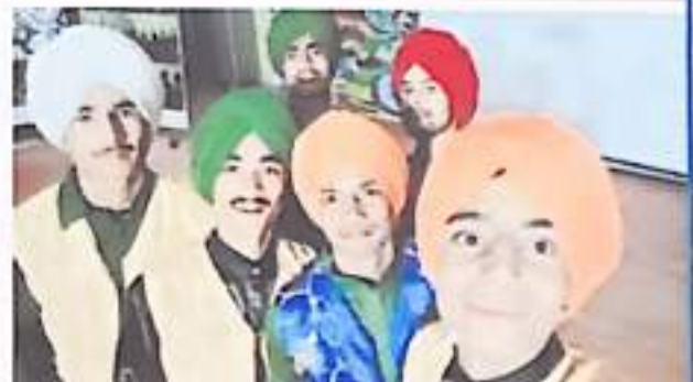
A colourful ethnic dance performance was given by the Cadets of 1JK&L Naval Unit of GDC Kathua during a meet organized by Directorate of 1JK&L NCC.