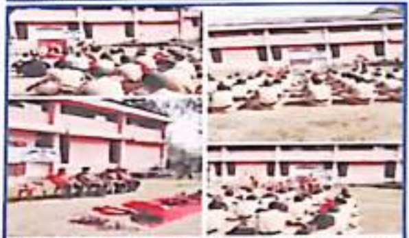
NCC Cadet of 4 J&K BN of GDC Kathua Participated in 5 days Basic Civil Defence Training on 26/11/2021 to 29/11/2021 organized by J&K Civil Defence, Home Guard & SDRF at GDC Kathua.