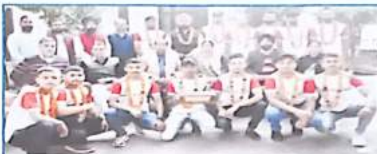
Kabaddi (Men) Winner team for lifting overall trophy in inter-college tournament in the session 2021-22