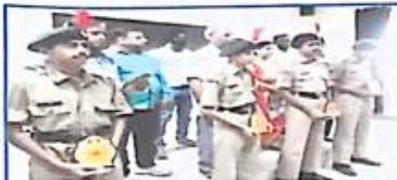
Principal GDC Kathua felicitated NCC Cadets Of 4 J&K Bn for their participation in Kavi Sammelan organized by NSS unit of GDC Kathua as a part of Azadi ka Amrut Mohotsav on 9/08/2021.