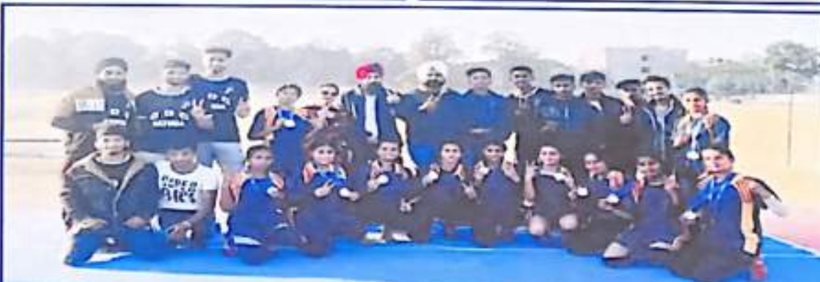
Kho-Kho (Women) team participated in inter-college tournament in the session 2021-22 and were declared Runner-Ups