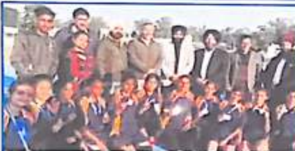
Women Runner-Up team posing with Secy. Gen, All India Kho-Kho Federation & Director Sports, Jammu Univ. in inter-college tournament