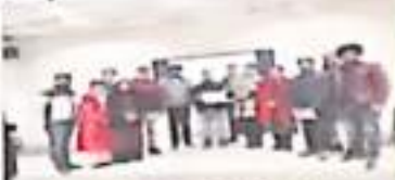
Participants during seminar on cyber crimes.

The GDC (Boys) organized a seminar on cyber crimes under the series of "Cyber Jaagrookta (Awareness) Diwas" on Dec 20, 2021. The seminar was held in the auditorium of the school. The seminar was attended by the students of the school and the faculty members. The seminar was organized by the GDC (Boys) and was held in the auditorium of the school. The seminar was attended by the students of the school and the faculty members. The seminar was organized by the GDC (Boys) and was held in the auditorium of the school. The seminar was attended by the students of the school and the faculty members.