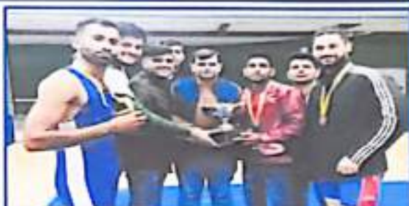
Wrestling (Men) team lifted overall trophy in inter-college tournament in the session 2021-22