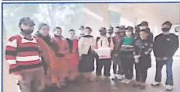
NSS Volunteers collected donations for National Foundation for Communal Harmony on 24th Nov.2021.