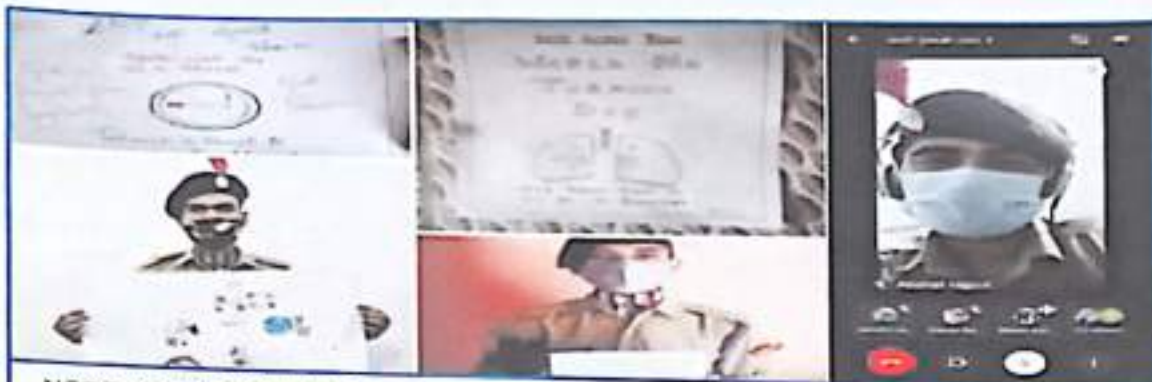
NCC Cadets of 4 J&K BN of GDC Kathua celebrated World No Tobacco Day on 31st May 2021 on the theme Commit to Quit. On the occasion series of activities organized including online poster making, articles, video messages and webinar on "Say no to Tobacco".