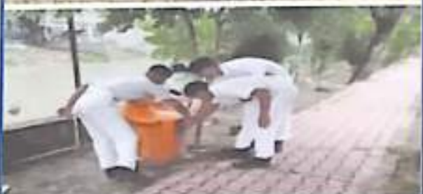
Cadets participated in a cleanliness drive organized by of NCC 1 JK&L Unit of GDC Kathua to promote Clean and Green Environment in the college Campus