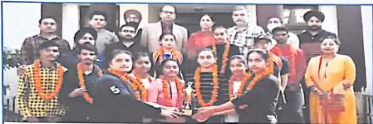
Judo (Women) lifted overall trophy in inter-college tournament for the session 2021-22