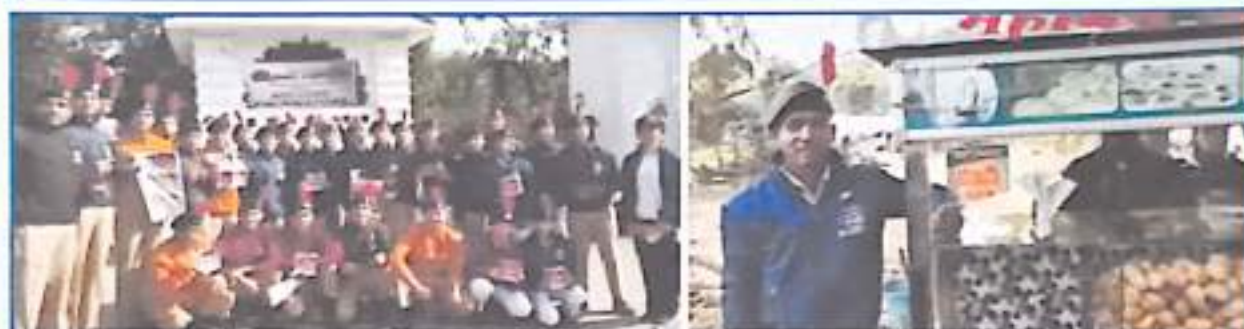
Cadets participated in "Anti-Drug Awareness Campaign" organized by 1 JK&L Naval NCC Unit of Govt. Degree College (Boys) Kathua on 22nd December 2021. The campaign was organized to promote awareness among the common masses about the harmful effects of Drug Addiction on people and society.