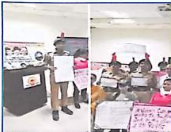
NCC Cadets of 4 J&K BN of GDC Kathua participated in Slogan Writing Competition organized by GDC Kathua as a part of Azadi Ka Amrut Mohatsav on 11th August 2021.