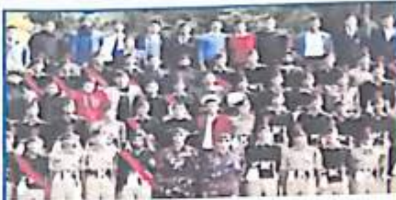
NCC Contingent of 4 J&K Bn of GDC Kathua participated in Republic Day Parade on 26th January 2022 at Sports Stadium Kathua.