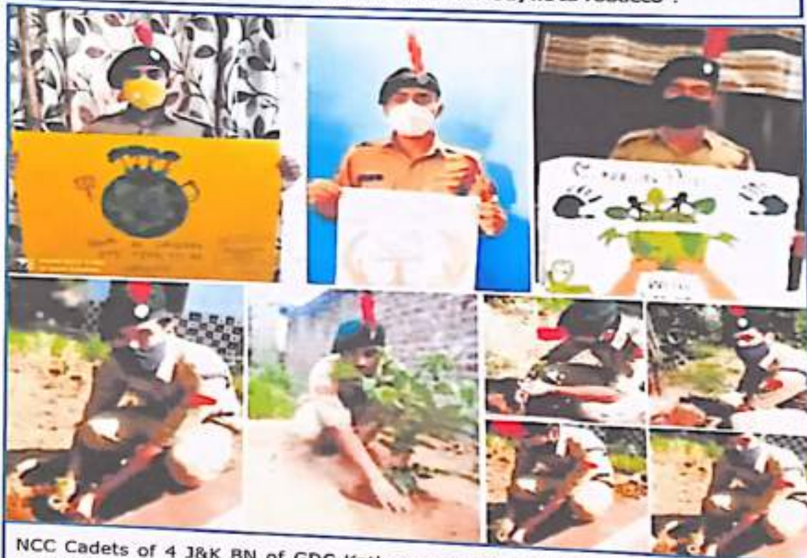
NCC Cadets of 4 J&K BN of GDC Kathua celebrated World Environment Day on 05/06/2021 by planting trees at their respective homes and displaying posters for safeguarding environment.