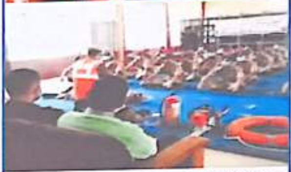
NCC Cadets of 4 J&K Bn of GDC Kathua attended one day Civil Defence Awareness camp on the theme Disaster Management, Road Safety and Traffic Rules organised by Civil Defence Kathua on 19/02/2022 at GDC Kathua.