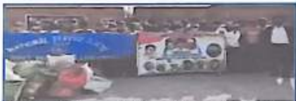
NSS volunteers of the college organized a Cleanliness Drive in the slum area of Kathua District near CTM. Anti Dengue Campaign was also organized on this Day.