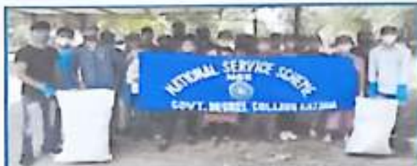
Cleanliness Drive was carried out by the NSS Volunteers in the college premises on 8th Oct. 2021