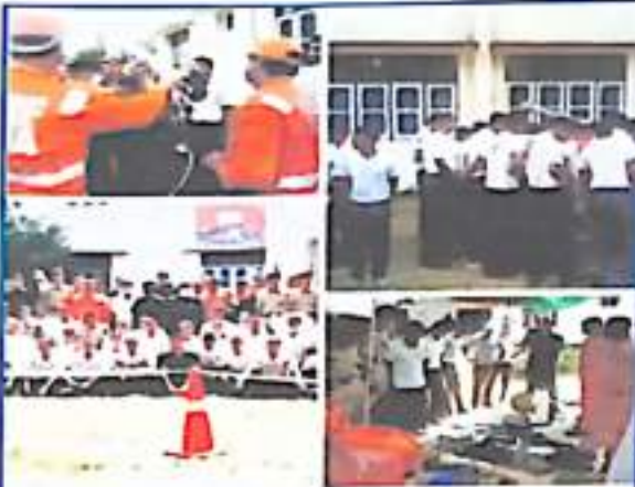
NCC Cadets of 4 J&K BN of GDC Kathua participated in Mock Exercise on rescue during Landslide and Earthquake organized by 13 Bn NDRF at GDC Kathua on 27th September 2021.