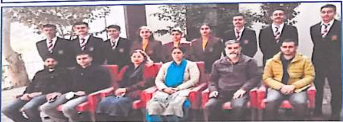
NCC Cadets of GDC Kathua felicitated by Principal and Faculty Members on 10th Feb. 2022 for attending Republic Day Camp 2022 held at New Delhi.