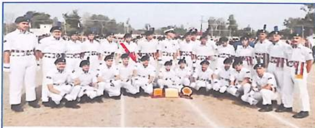
1 JK&L Naval NCC Unit of Govt. Degree College (Boys) Kathua participated in the Republic Day Parade at District Sports Stadium Kathua on occasion of Independence Day Celebrations on 26th January 2022.

Specimen Principal Govt. Degree College Kathua