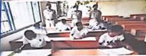
NCC Cadets of 4 J&K BN of GDC Kathua celebrated Gandhi Jayanti on 2nd October 2021 by organizing a series of activities like Plogging Run, Cleanliness Drive and Painting Competition on the theme Swachh Bharat and Clean India Green India.