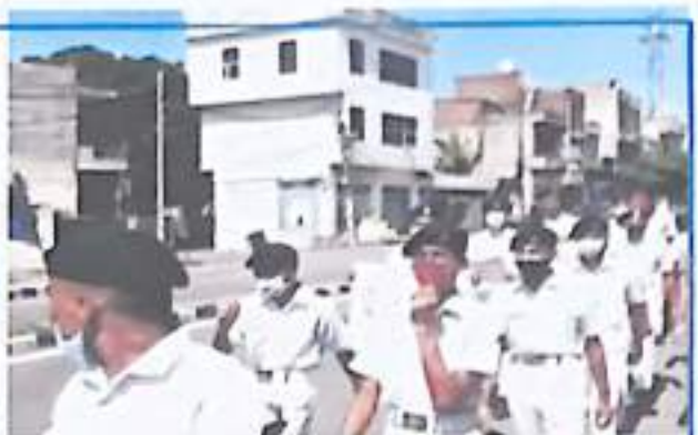
Cadets of NCC Naval wing of the college took out a Swacchta Rally under Swacchh Bharat Abhiyaan. Cadets displayed placards having slogans written on them to ware public about the importance of cleanliness of their surroundings.