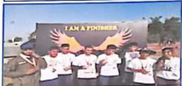
NCC Cadets along with ANO of 4 J&K BN of GDC Kathua participated and completed Half Marathon 21.1 Km organized by Kathua Police at Sports Stadium Kathua on 14th November 2021.