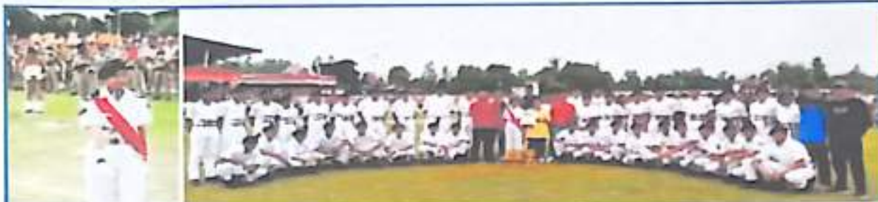
1 JK&L Naval NCC Unit of Govt. Degree College (Boys) Kathua participated in the Independence Day Celebrations at District Sports Stadium Kathua on occasion of Independence Day Celebrations on 15th August 2021.