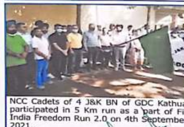
NCC Cadets of 4 J&K BN of GDC Kathua participated in 5 Km run as a part of Fit India Freedom Run 2.0 on 4th September 2021.