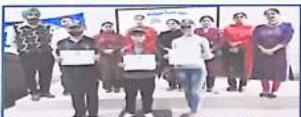
Organized an Essay Writing Competition on "Role of Maulana Abul Kalam Azad in Indian Freedom Struggle and in the Field of Education" was organized by NSS on 11th Nov. 2021