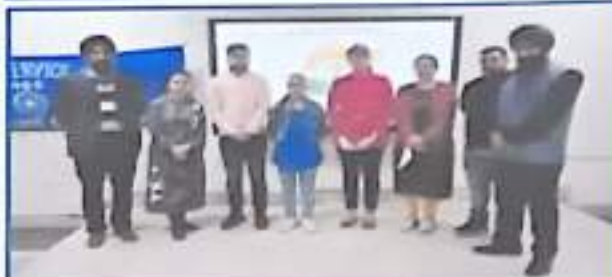
On 22nd of Nov. 2021, NSS Units of GDC Kathua organised a Declamation contest with the topic "Patriotism and National Building" Sabka Sath, Sabka Vikas, Sabka Vishwas, Sabka Prayas.